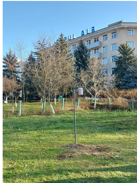
The White Water Lily – Cahul