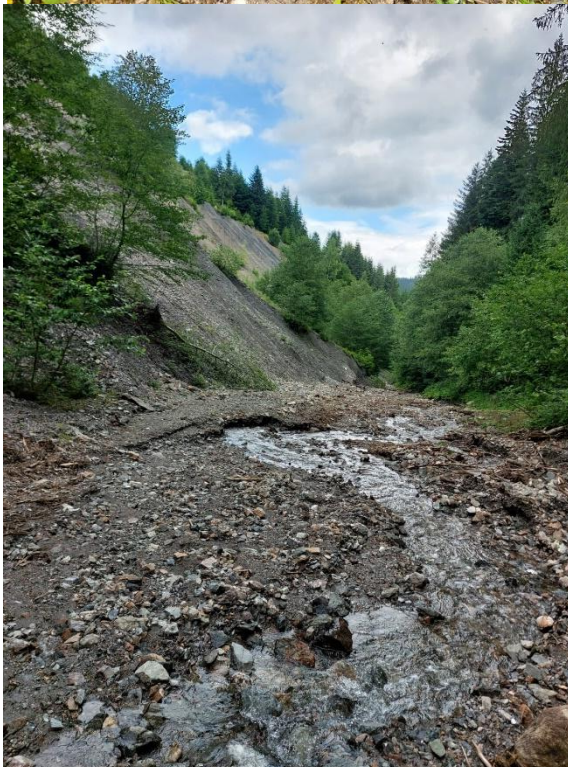
Fig. 2 Images from field research conducted between July 17 and July 20, 2025